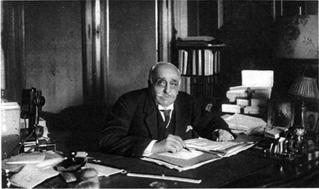
ԽՅՂՈՍ ՆՈՒՊԱՐ ՓԱՇԱ ԱԳԱՅԻՆ ԲԱՐԵՐԱՐ ԵՒ ՀԻՄՆԱԴԻՐ Հ. Բ. Ը. ՍԻՈՒԹԵԱՆ