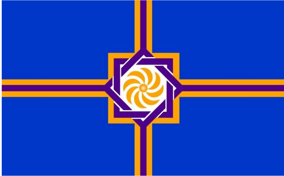
The Flag of the State of Western Armenia