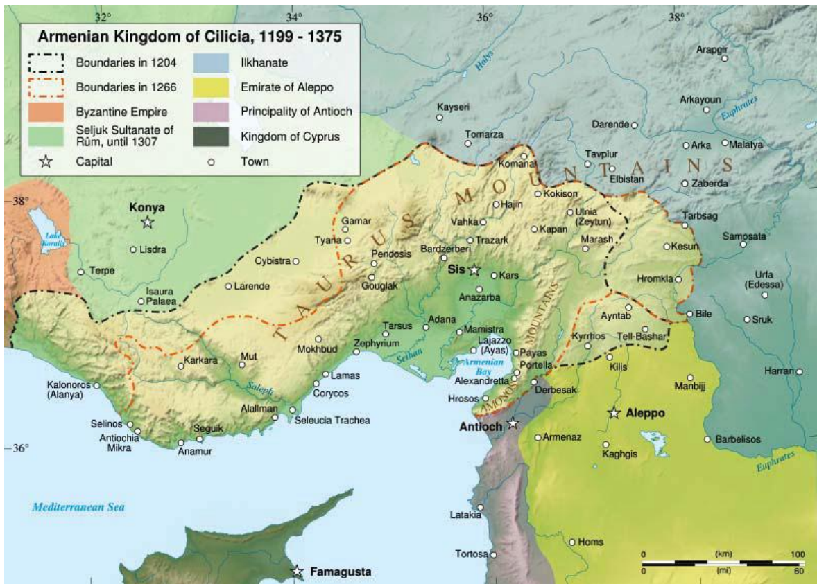
Map of Cilicia