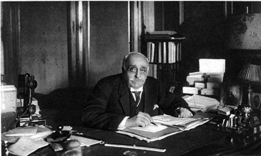
ԲՈԳՈՍ ՆՈՒԲԱՐ ՓԱՇԱ ԱԶԳԱՅԻՆ ԲԱՐԵՐԱՐ ԵՒ ՀԻՄՆԱԴԻՐ Հ. Բ. Ը. ՍԻՈՒԹԵԱՆ