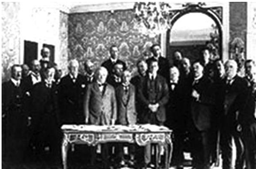
Participants of the Treaty of Sevres