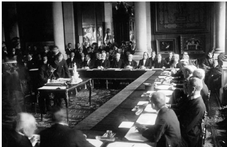
The Turkish delegation put his signature under the Treaty of Sevres