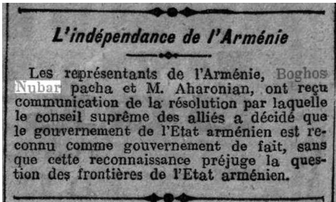
Boghos Nubar Pasha and Avedis Aharonian are being informed about the Armenian State recognition